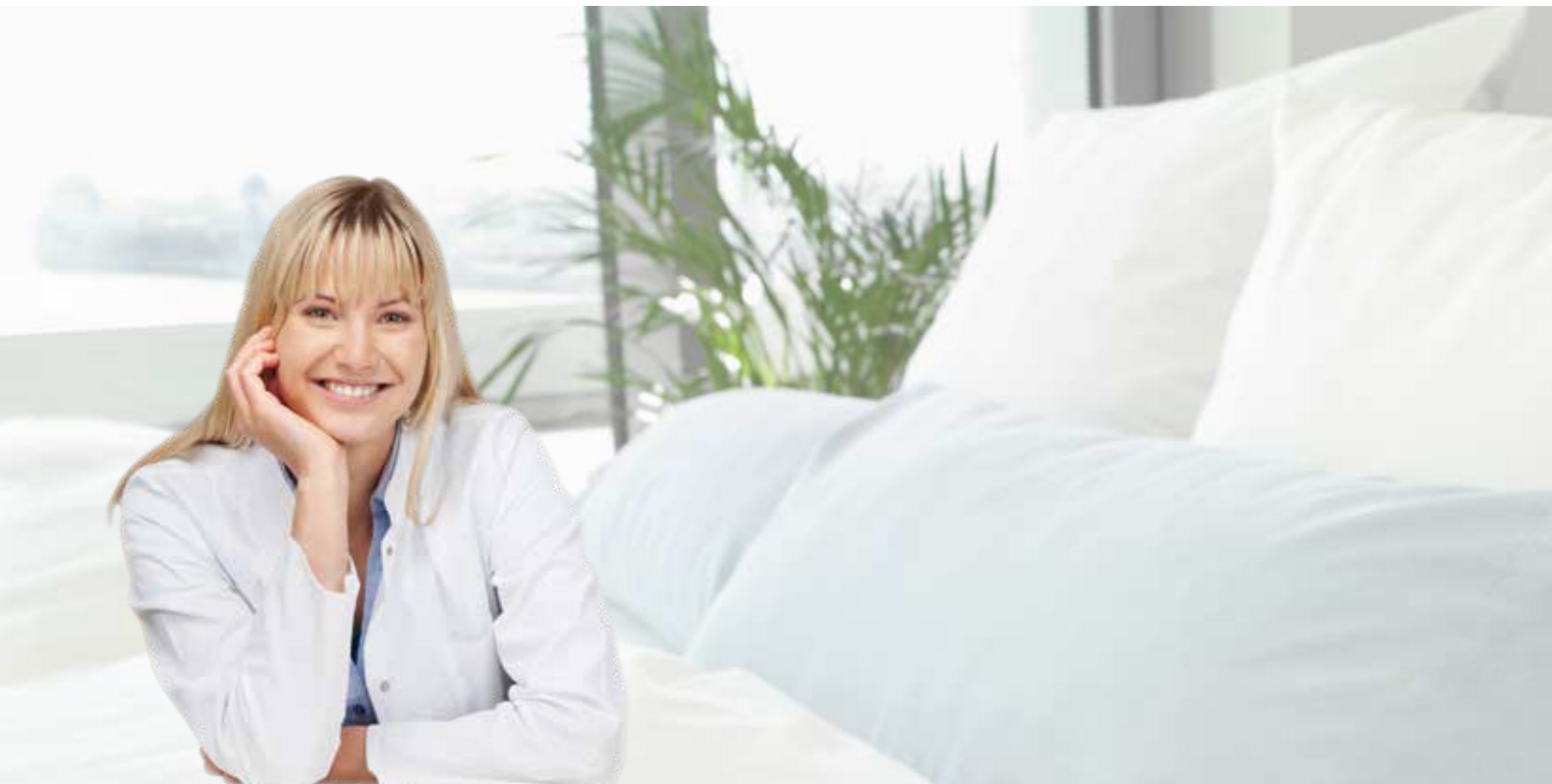
JOYCEeasy next FF