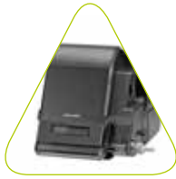
prismaAQUA – WM 29680 Humidifier