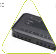
prismaPSG – WM 29690 PSG Module