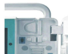
Heating function (Optional), suitable for infusing in winter or there is Requirement for the fluid medication temperature.