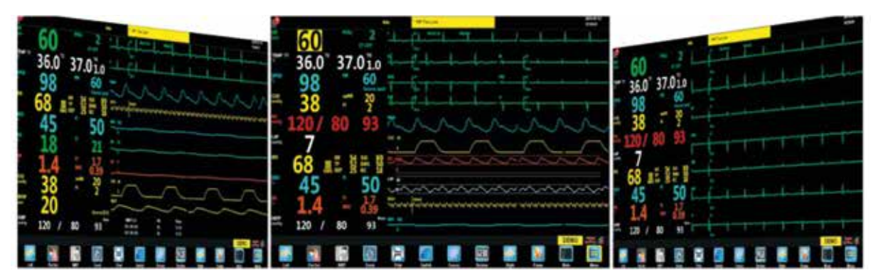
Vivid visualized icons ... Engineered for the most impressive operation

SEV:0-10%: ± (0.15%+5% of the reading) DES:0-22%: ± (0.15%+5% of the reading) Agent identification time: <20s(typical <10s)