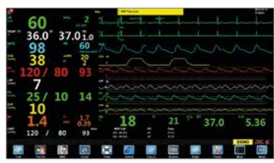
4 channel IBP