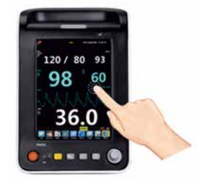
Touch Screen (Optional)