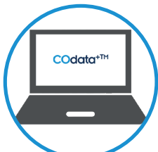
FREE COdata™ software