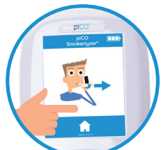
Easy to use touchscreen interface