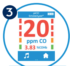
3 Instant CO readings