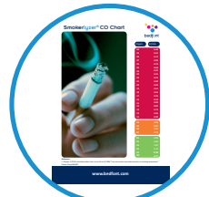
Familiar green, amber & red traffic light system