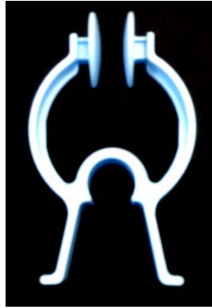
Code 30851/M1 Code 30851/M5