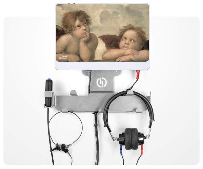
Cello on its optional wall hanger.

Cello is a PC or iPad® controlled diagnostic audiometer, capable of performing fast and accurate air, bone and speech audiometry exams, as well as several additional tests including QuickSIN ^{\text{M}} , HF audiometry, and video-VRA. With its revolutionary design, complete feature set and top reliability, Cello is a little masterpiece, ideal for anyone unwilling to compromise on appearance and user experience.